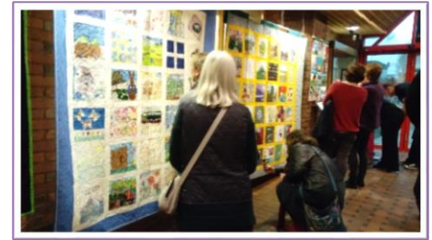
People admiring the Cumbria Quilts at Tullie House

Not festive exactly but currently on display at Tullie House are the 'Quilts for Cumbria,' a BBC Get Creative project run in collaboration with Up for Arts Cumbria. Earlier in the year lots of us made patches for this project and you can see them at Tullie until 19 th January.