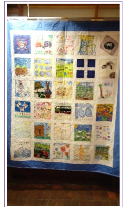
Our Heathlands patches made into one of the Cumbria Quilts