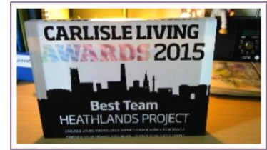
Our newest award, well done everyone!